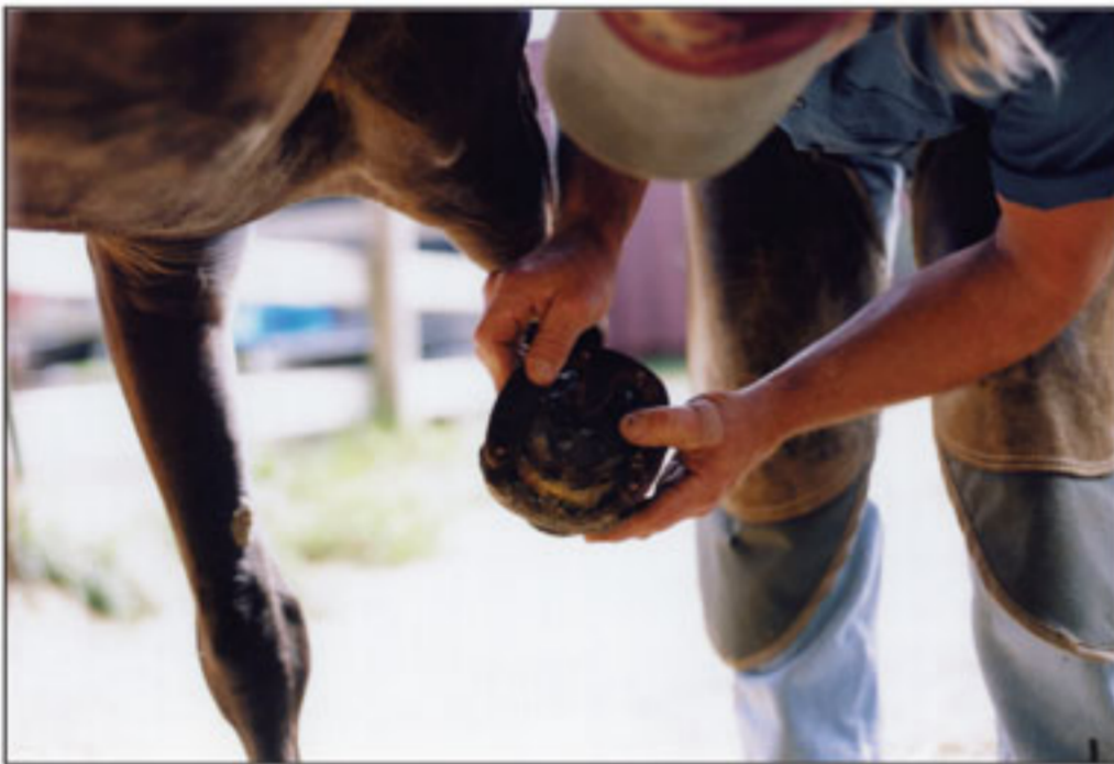
AUG. 14, 2004: Bob fits the shoe to what's left of the hoof, commenting on the amount of white space showing through. He eventually added a little glue to the outside to fill in the hoof wall area ripped off by the shoe.