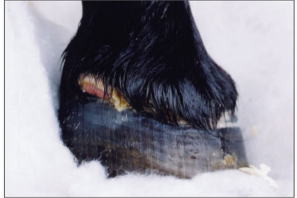
JUNE 15, 2004: The abscess on the left foot has gotten bigger, as well. X-rays at this time showed some sole growth on the left hoof but very little on the right.