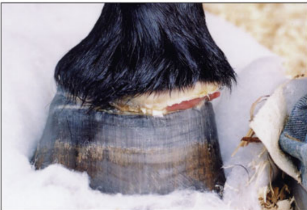
JUNE 15, 2004: The abscess on the right hoof has gotten much larger and continues to drain an extensive amount of dead tissue. The hoof wall has caved in a little under the abscess.