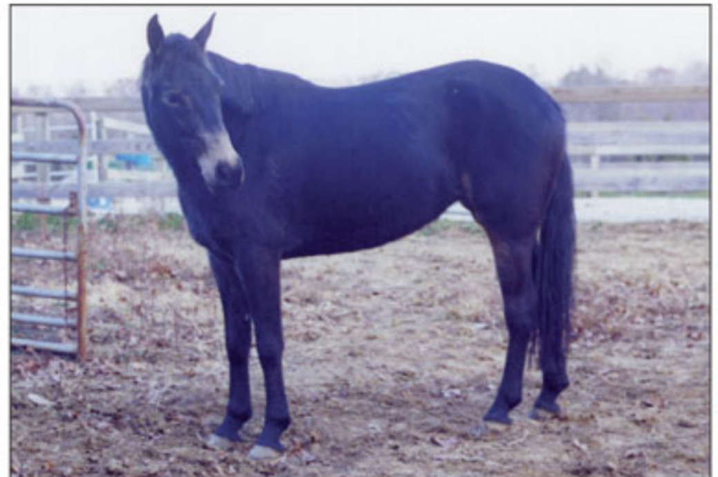
OCTOBER 2001 Angel, age 7, is very thin after suffering an acute case of enteritis in September 2001, right before she was supposed to leave Ohio for home. With outstanding care, she managed to pull through. She lost a lot of weight but did not stay thin for long.