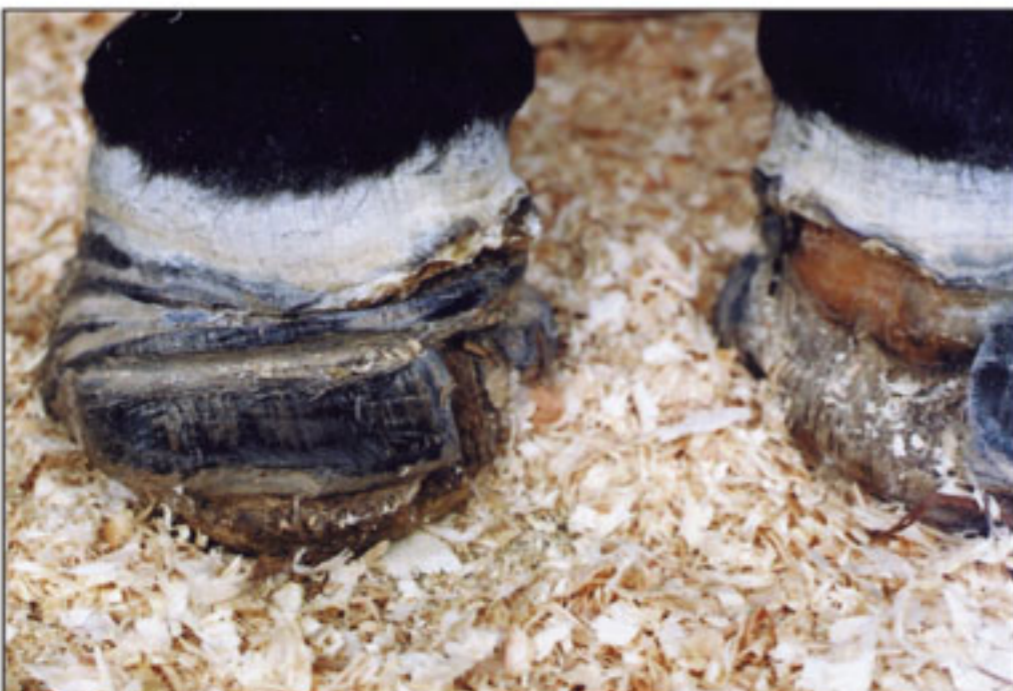
NOV. 14, 2004: Angel's right hoof has lost a chunk of inside wall, similar to that lost by the left one in September. It does not seem to bother her. The coffin bone is covered with a keratinized layer, and she doesn't appear to notice the exposed area.