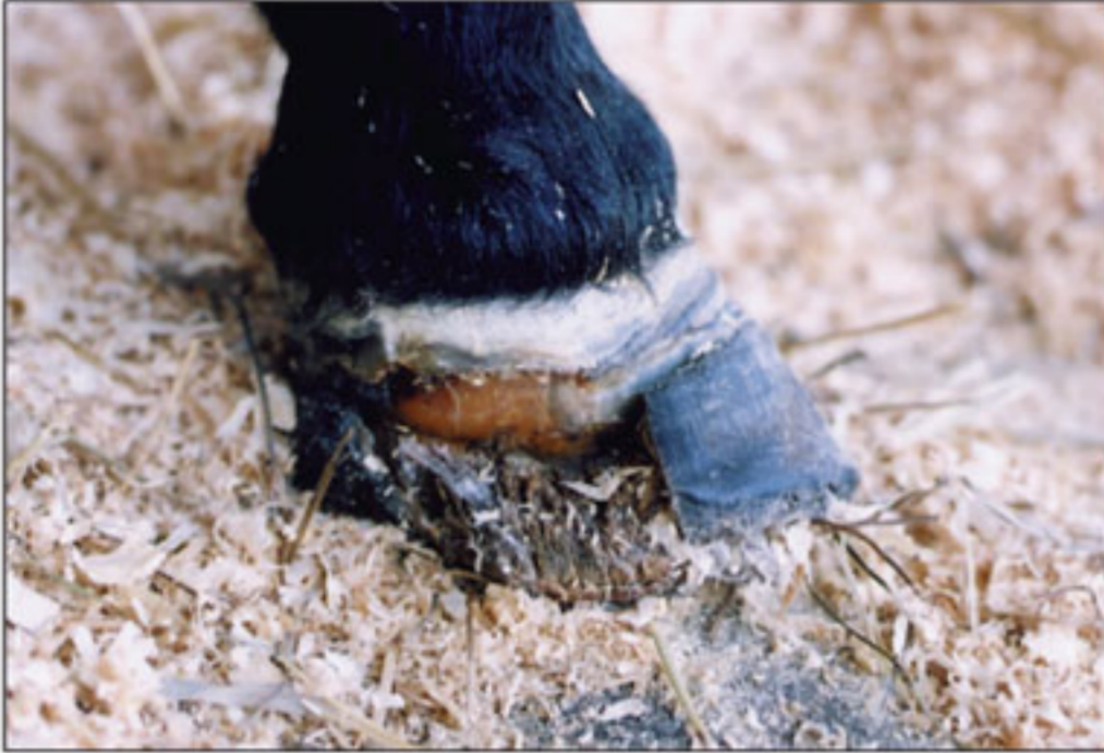
OCT. 31, 2004: Another closeup of Angel's left hoof shows the crumbling wall has remained the same for the past two weeks, rather than getting worse.