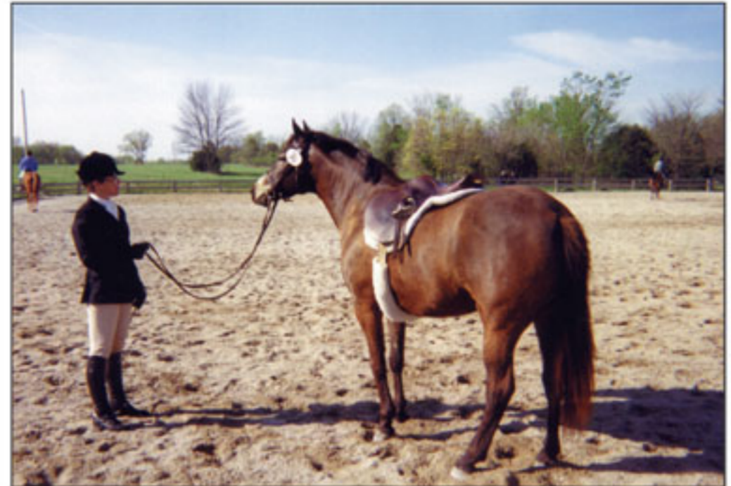
APRIL 1998 Angel, age 4, is severely overweight at a dressage schooling show at Bridlespur. In November 1998, she moved to Ohio on a lease. Over the next three years, she had two foals and stayed at a more appropriate weight.