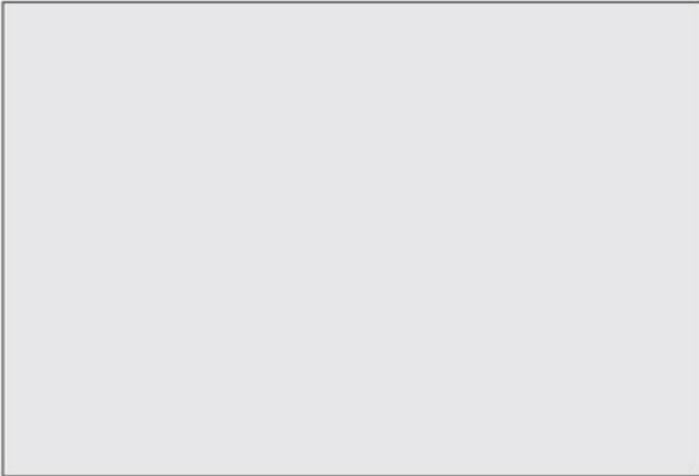
JUNE 2, 2004: No photo was taken of Angel's left hoof on June 2. There was a very small abscess starting, but nothing like the right hoof. Both legs had filled in with fluid.