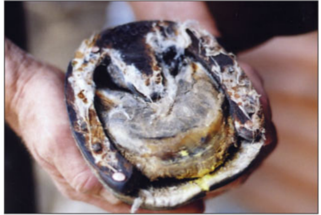
AUG. 3, 2004: The bottom of Angel's left foot shows the bulge in the middle, where her coffin bone has been pressing on the sole, and the empty shell around the edge, where the white line should be.