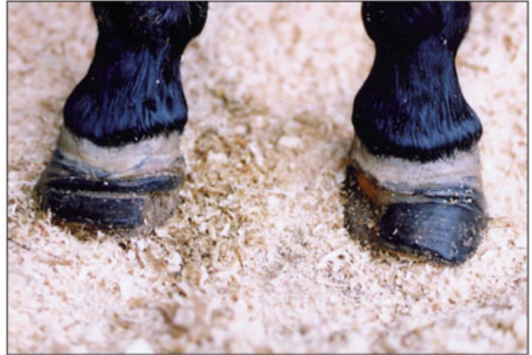
NOV. 23, 2004: Angel's feet are once again lined up straight, or even towed out a little, which is normal for her, after months of towing in. No one noticed it happening. The hooves just straightened out. They also are growing even faster.