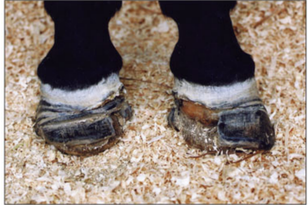
NOV. 14, 2004: Both hooves are the sum of two processes: the bottom half, made up of the twisted, stretched hoof damaged by laminitis, and the fairly normal looking upper half, created by her chemistry seemingly being in balance during the summer and fall.