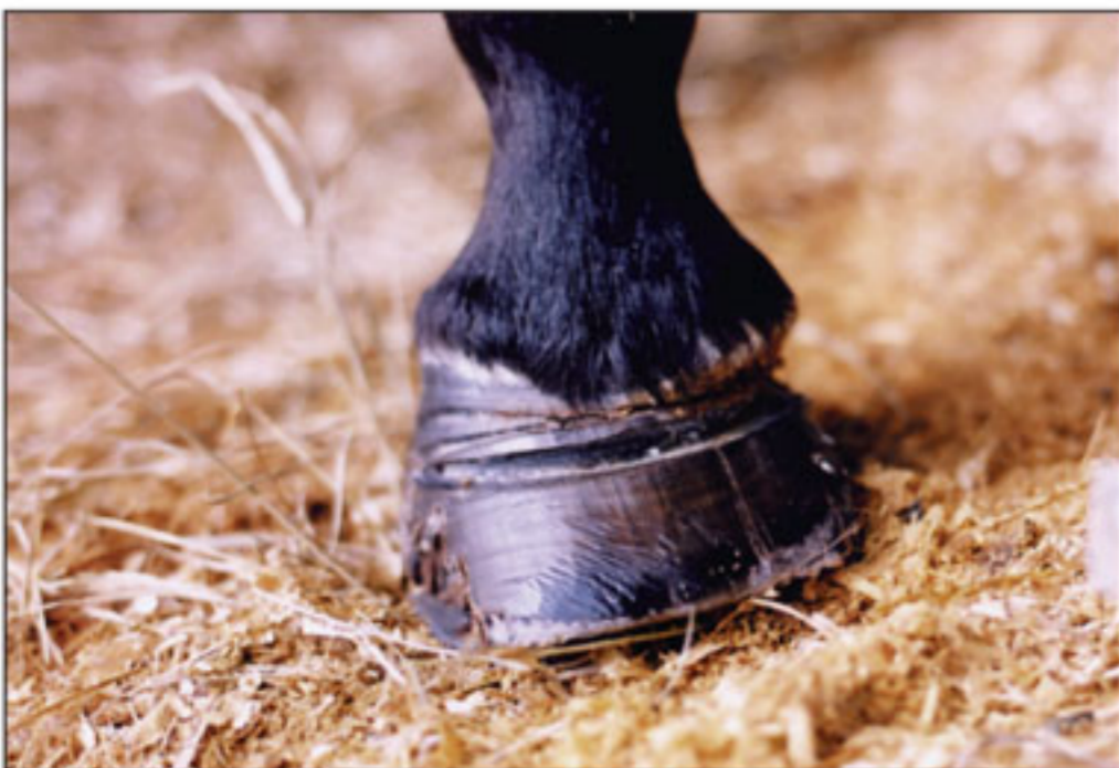
AUG. 14, 2004: Angel's hoof is back in business, even if not the most conventional looking foot. She was sore for a few days after the hammering, but six days later, she was walking on the hoof as if it felt good.