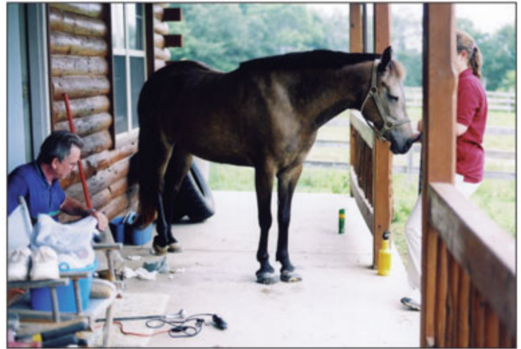
AUG. 3, 2004: Angel rests after the grooving. Her feet already appeared more comfortable than before the session started.