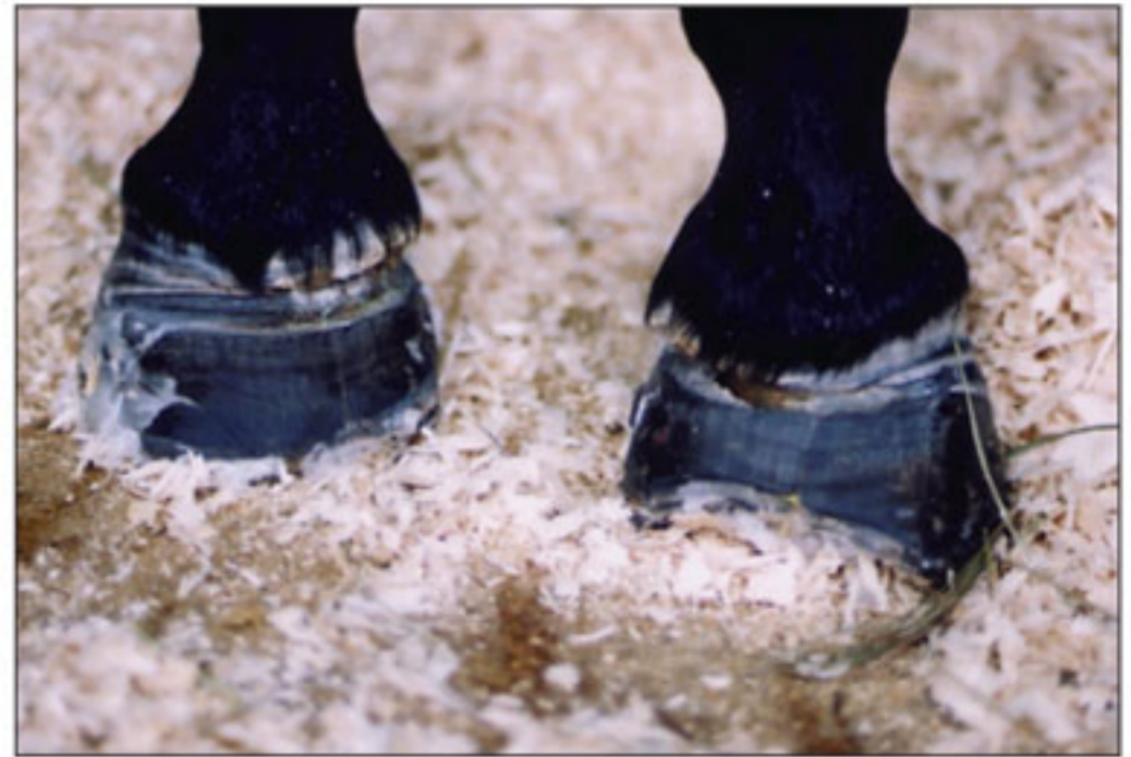
AUG. 20, 2004 Angel's feet, pathetic though they are, appear to be heading in the right direction of healing.