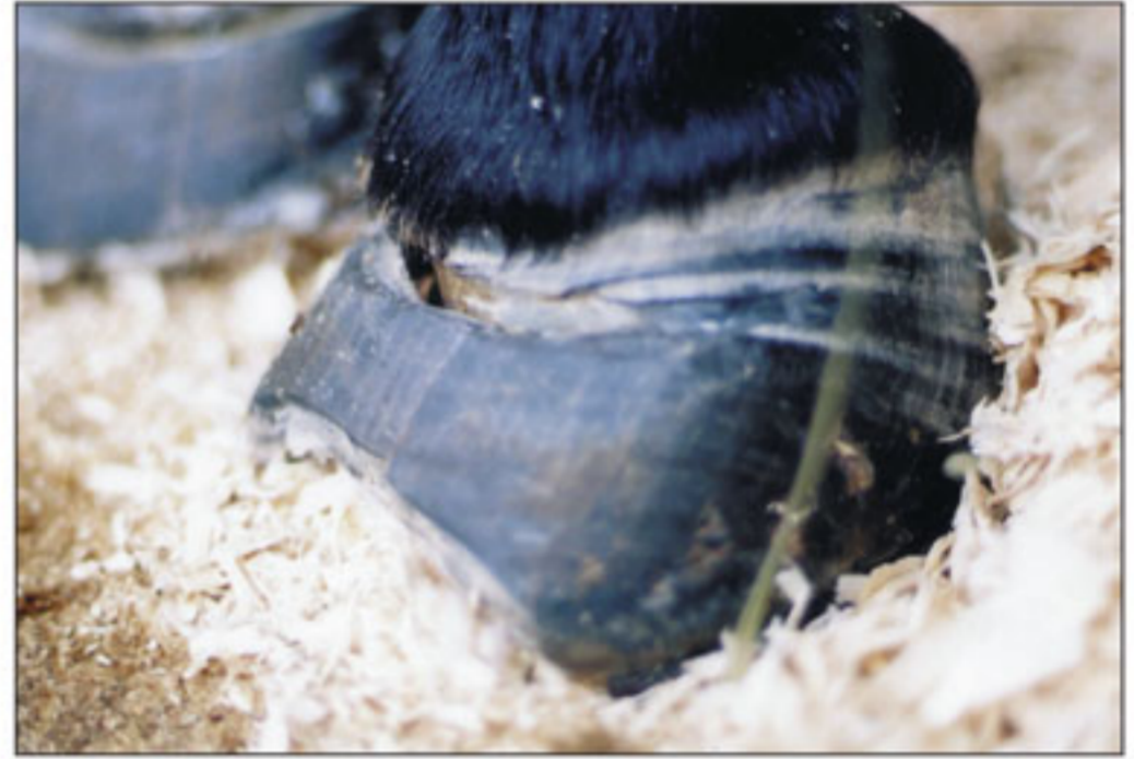
AUG. 20, 2004 The separation line allows one to see how there's no connective tissue underneath. That whole wall could come off.